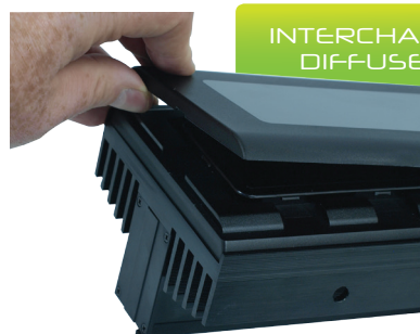
INTERCHANGEABLE DIFFUSER LENS

Installation is quick and easy, requiring only 12-32V DC / 24V AC +/- 10%.