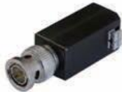
DS-1H18 Video Balun